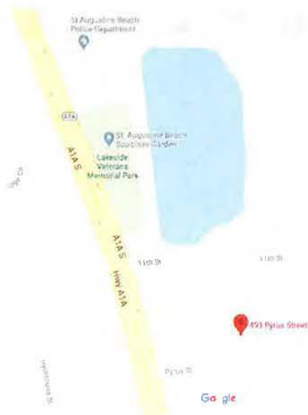
Photo: Pyrus St Relation to 11th St

Pyrus St. is a quiet "No Outlet" marked residential street located within the city limits, just one block south of the 11th St, and exits to the main roadway of A1A South