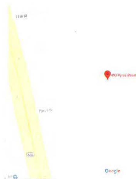
Photo: Pyrus St Relation to Island Hammock