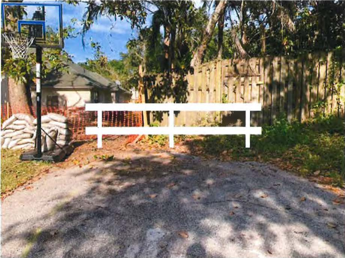
Photo: Pyrus St., as of 5/18/2020, showing proposed barricade design (not to scale)