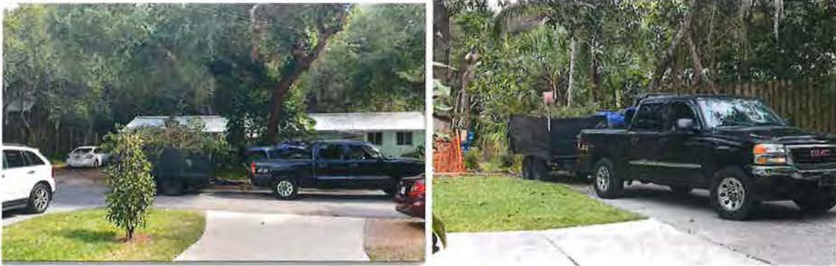
Photos: Truck hauling debris of 240 Bluebird Ln on 9:36am Saturday (before Mother's Day)