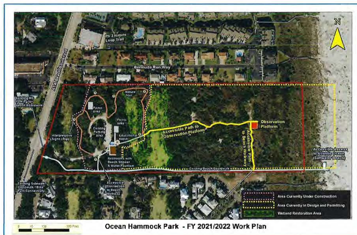
Figure 4 - Work covered Under Sept. 2020 CPI Application