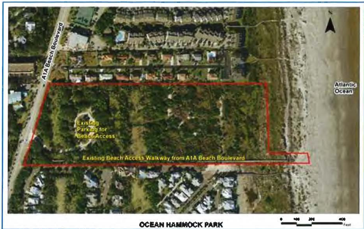
Figure 2 - Ocean Hammock Park Existing Condition

In 2018, the Park Management Plan was modified (Figure 3) to incorporate the newly acquired 4.5 acres. The Modified Management Plan included restrooms, information kiosk, nature trails with interpretative signage, picnic areas, a picnic pavilion, observation deck, education center, children's playscape, canoe kayak storage, bike racks, and wetland and dune restoration.