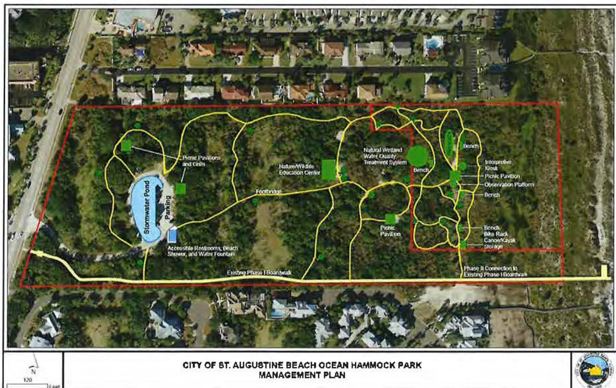
Figure 3 - Ocean Hammock Park Management Plan

In 2018, the Park Management Plan was modified (Figure 3) to incorporate the newly acquired 4.5 acres. The Modified Management Plan included restrooms, information kiosk, nature trails with interpretative signage, picnic areas, a picnic pavilion, observation deck, education center, children's playscape, canoe kayak storage, bike racks, and wetland and dune restoration.