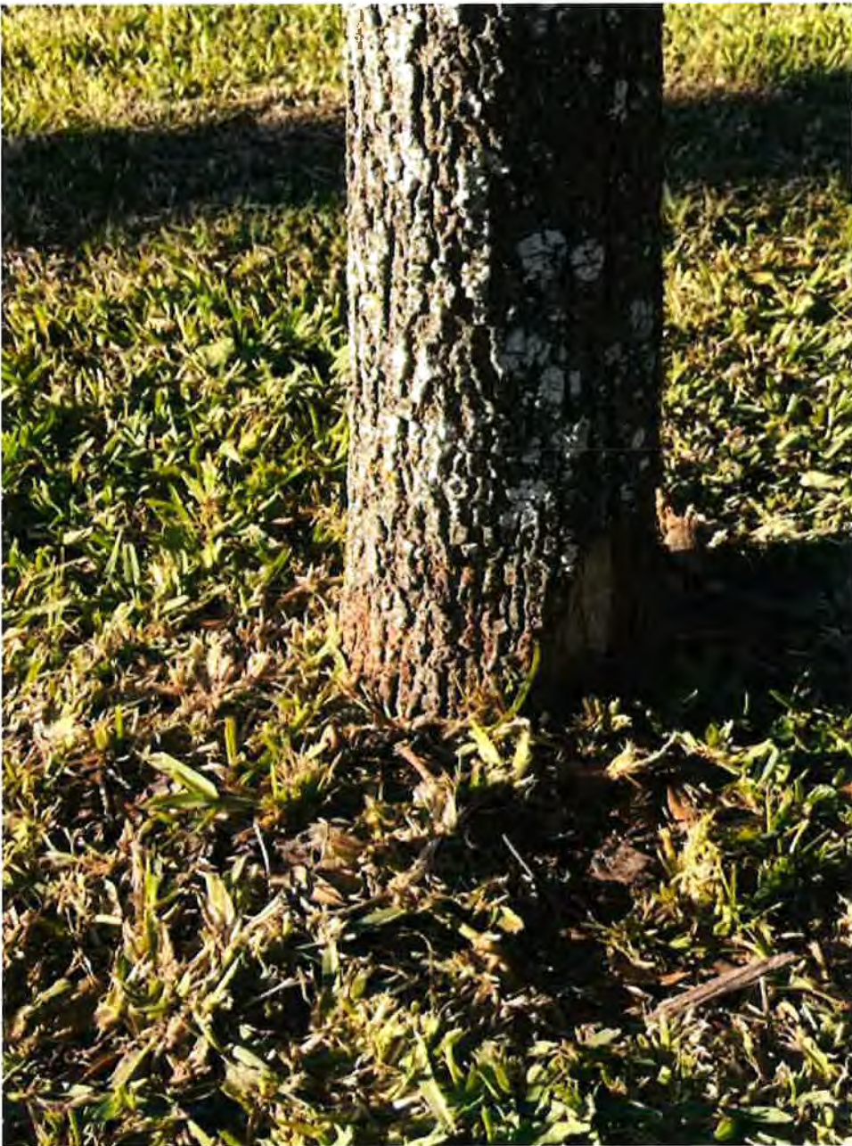
Exhibit C - 2